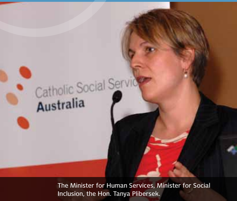
The Minister for Human Services, Minister for Social Inclusion, the Hon. Tanya Plibersek.