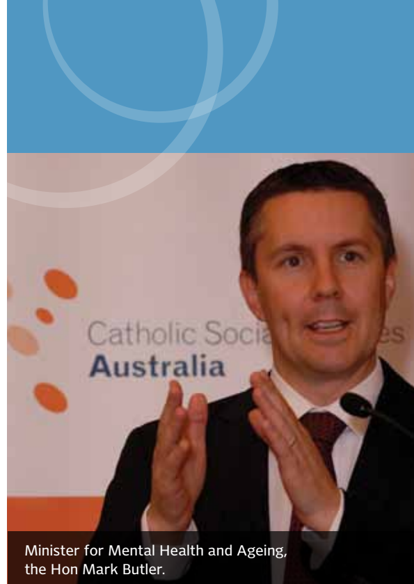
Minister for Mental Health and Ageing, the Hon Mark Butler.